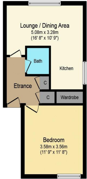
Floor area 36.7 sq. m. (395 sq. ft.) approx

Total floor area 36.7 sq. m. (395 sq. ft.) approx